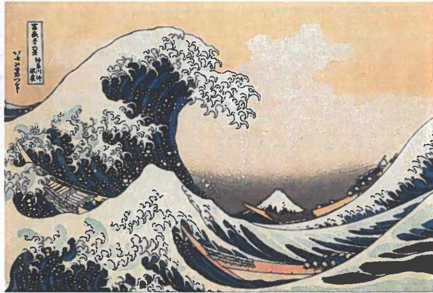
The Great Wave Off Kanagawa by Katsushika Hokusai (c. 1829-1833). Metropolitan Museum of Art

There may be a reference to Hokusai's "The Great Wave off Kanagawa" (c. 1829-1833), the first print in his series Thirty-six Views of Mount Fuji. That influential print, one of the most recognized pieces of art in the world, has the sacred mountain of Japan, Mount Fuji in the background.